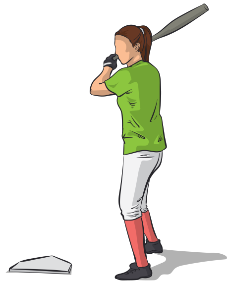
Proper Batter Stance