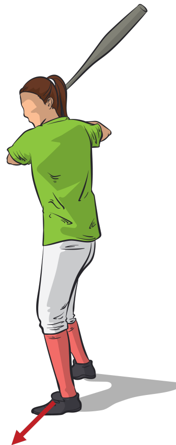
Batter takes a short stride step forward.