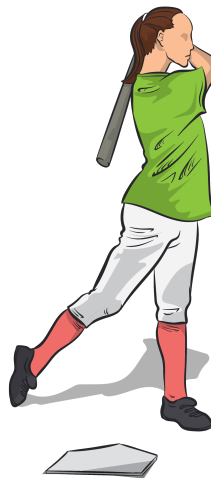
Positive stride and swing moves.